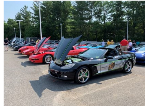
NVCC Annual Corvette Car Show 2019