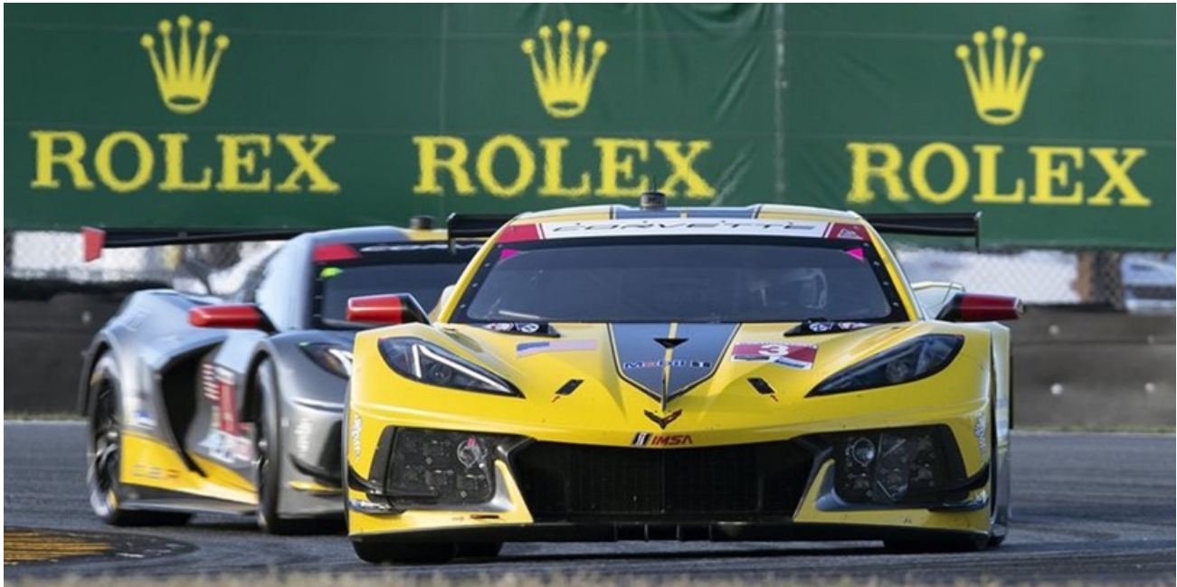
C8-R FINISHES 1ST AND 2ND AT THE ROLEX 24