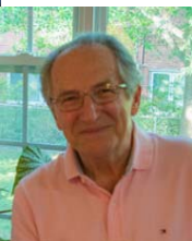
Store Tab Tabellario