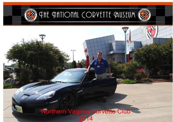
Northern Virginia Corvette Club 2014