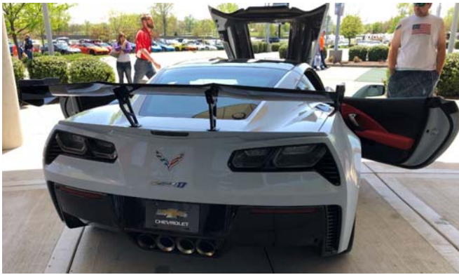
MORE FROM THE BASH