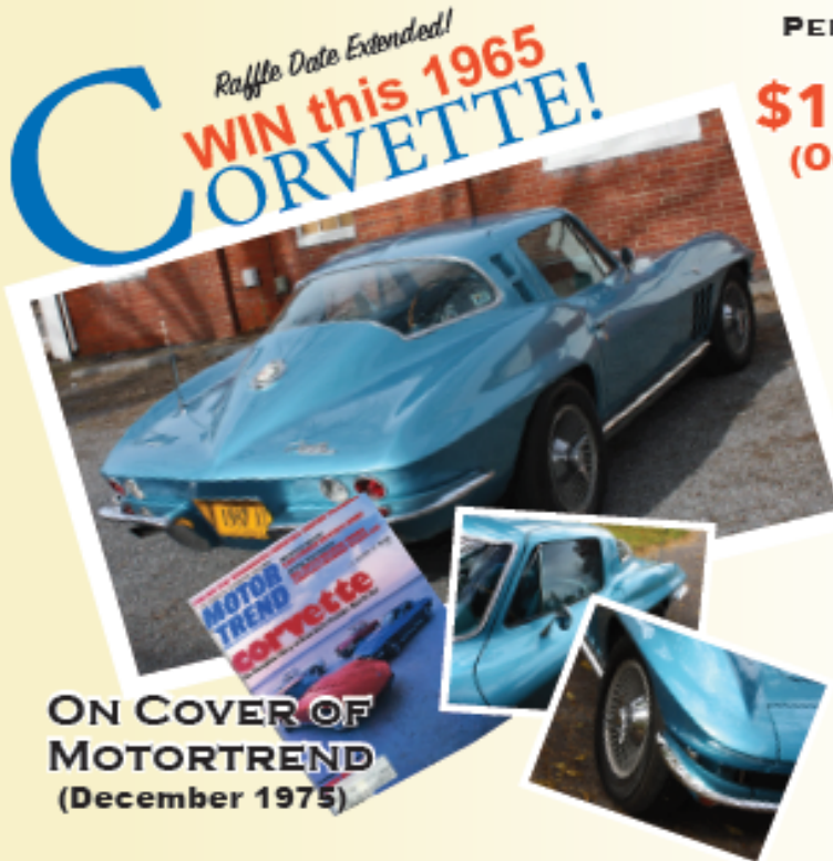
ON COVER OF MOTORTREND (December 1975)

PROCEEDS from raffle benefit Valiant Virginians, a 501c3 nonprofit, that provides transportation assistance to deserving Shenandoah Valley families in need of a car or car repairs. Must be 18 years or older to enter. Winner need not be present to win and will be notified by phone & email.