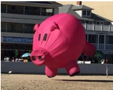
ANOTHER FLYING PIG