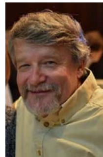
NCCC Governor Andrej Balanc