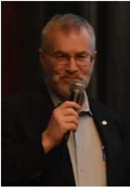
TRIVIA BY JOHN SCOTT

A4. The 2009 ZR-1 was the first 200+ mph production Corvette ever made. It was also the first production Corvette to retail for more than $100,000.