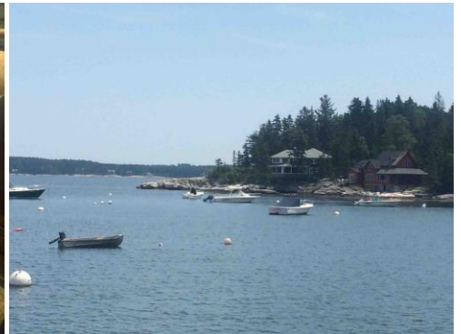
Islands near Bath, Maine