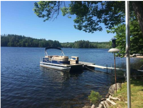
View from my uncle's house in Reidfield