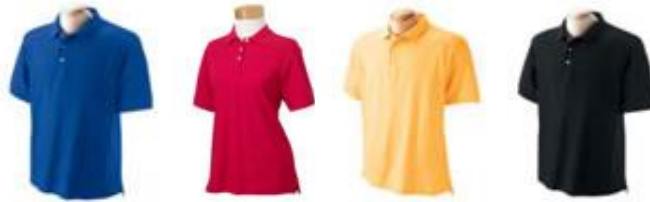
NVCC Polo Shirts-Customizable

If you have an idea for a club item to sell, please contact our council to pitch the idea!!