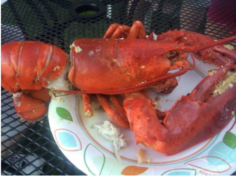
Giant lobster – it's what's for dinner (cause what else would you eat in Maine?)