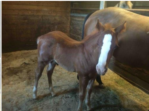
My cousin's horse in Albion, Maine