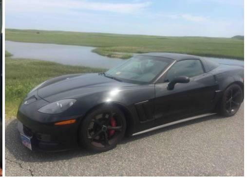
Bay side of the ocean, Reid State Park