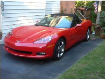
Newest Addition to Burke Hammakers By Dick Hammaker

It was a sad day but traded "The Rocket" (5th Generation 2001 Convertible) today for "Recce" (6th Generation 2008 Convertible). "Recce" is a 2008 Victory Red Corvette Convertible with lots of "bells & whistles", but alas it's an automatic transmission with paddle shifters. These old bones were getting tired of clutching my fun 6-speed manual transmission. Denise even drove it for an hour today and had no complaints.