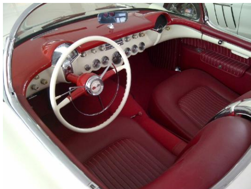
Beach in NY!

I loved these two – a 60 and 61, complete mirror images of each other, even the license plates. Laurie's note: These 2 vettes frequently attend Vettes @ the