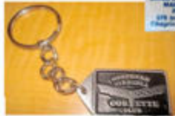
NVCC Keychains $10.00 ea

GUARANTEE If the April Day, 2011 is cancelled due to inclement weather, the date of the event will be postponed to the next available date. All items are sold as is. No returns or exchanges. Payment in cash or by check. Cash is preferred. All items are sold on a first-come, first-served basis. No cash on hand. Payment to be made at the time of purchase. No cash on hand. Payment to be made at the time of purchase. No cash on hand. Payment to be made at the time of purchase.