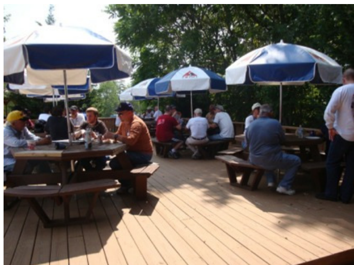
My favorite part of many NVCC events, eating at the C cubed event. Actually grilling our own saved time and money over outside vendor supplied food.