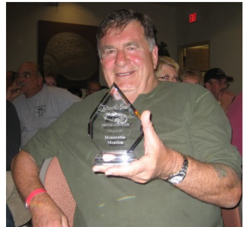
Don with an honorable mention.