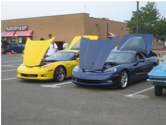
Do Don and John always park in the same order?