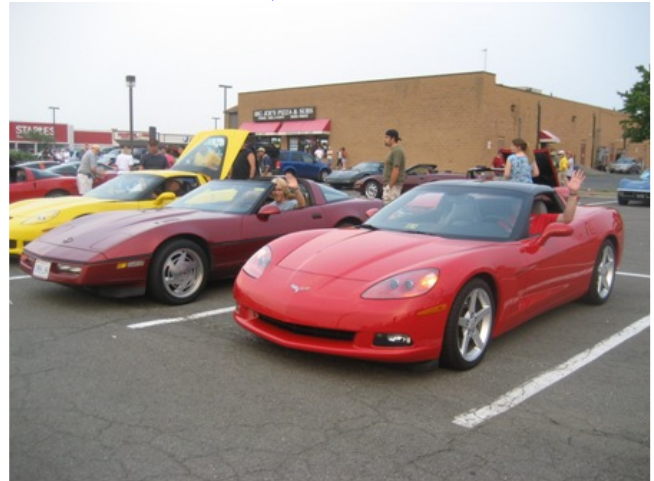
Family togetherness vette style.