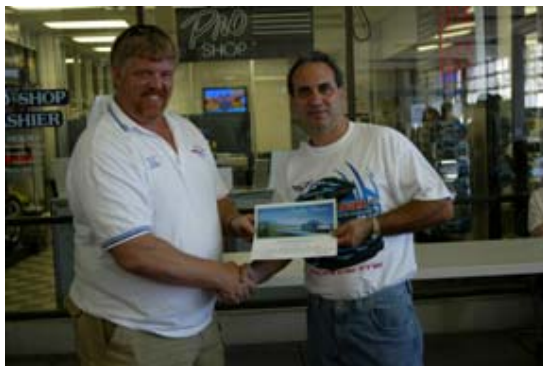
The Glass Gazette December 2005