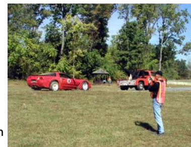
Locking brakes not good!