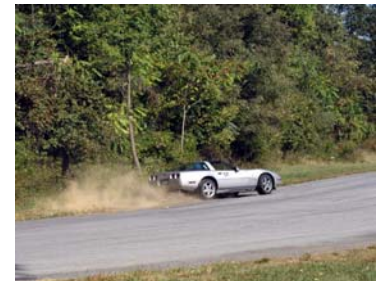
Shortcuts not allowed!

We took a long lunch break to give everyone a rest and finished up well before 4 o'clock. Then it was off with the numbers, pick up the cones and timing gear, cleanup, put the street tires back on, help get cars on trailers, tools put away, and get ready to head home. One of the great things about this time is all the compliments the NVCC receives from non-club members. It makes it all worthwhile as the hosting club that everyone takes the time to thank the club workers.