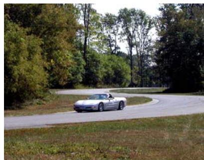
The only Z06 automatic convertible that I know