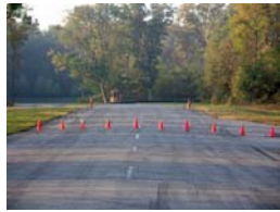
Turn one Sunday

Sunday morning at the track the dew was on all the cars as the sun hadn't burned everything off yet. The goal was to run 7 events again but in the reverse direction from Saturday. There were a couple of Vettes missing from accidents or mechanical failures and we picked up a couple of people who could only run Sunday. I was anxious as this was my fourth year running in this direction and being a person who keeps track of such things, in each of the prior years I had gone faster each subsequent year. Could I coax the Z06 to go quicker still? 2004 saw me run with brand new sticky Kumhos. Now they were getting a bid long less sticky. Yesterday was fun but it provided me no comparison to prior years.