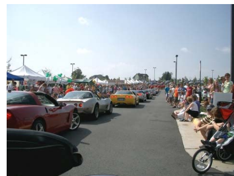
Photo of Haymarket Day Parade and Show.

Cruise participants will be divided into groups of 30 cars so that we can fit into the overlooks at the north end of Skyline Drive. At 10:30 AM we will caravan to the Shenandoah National Park with a police escort. Cruise to a scenic overlook and socialize, take pictures, etc. After leaving the overlook, we will caravan down to Brookside Restaurant for lunch. After lunch, we will re-enter the park and reassemble at the Stony Man overlook. From there, we will caravan to the Big Meadows visitor center where we will attempt to take a group picture. Time permitting, other overlook stops may be made. The cruise ends at Big Meadows. Please register on the website events tab, on the forum post or e-mail me at lilredcorvette94@yahoo.com if you wish to join the Centreville caravan to the cruise starting location. Directions: take Route 66 to Exit 53A to Route 28 South and then take the Route 29 South Exit, immediately turning right into the parking lot. There is a Mobil gas station and Joann's Fabrics in this plaza. Please be sure to gas up/restroom/coffee/etc before we leave.