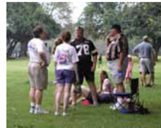
Commiserating at the Picnic

The first Sunday of August was the annual NVCC Picnic/BBQ at Algonkian Regional Park, with a great turn-out from the club (over 60 people in attendance!) as well as decent weather for *most* of the day (thank God for picnic shelters). It was nice to see everyone out enjoying the weather, food, and lovely 'vettes. Club members spent the day enjoying hot dogs, hamburgers, coleslaw, potato salad, and other picnic items while playing badminton, bocce ball, and spending time with their families and friends.