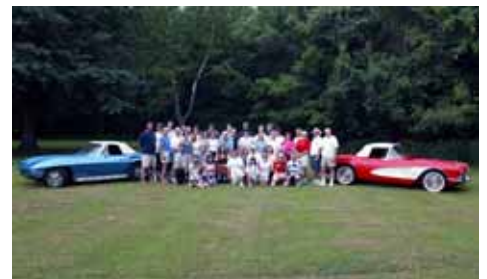
Historic Vettes and people at picnic